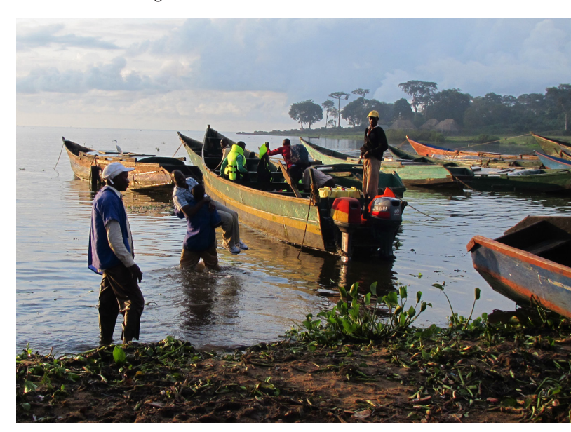
MUWRP staff travel by boat to remote islands in Lake Victoria with all necessary supplies to provide HIV prevention, care and treatment services.

MUWRP recently renovated the Koome Health Center on the island to better serve the community and to bring HIV care and treatment services closer to this fishing community. Plans are underway to bring SMC services to more fishing communities throughout these remote islands.