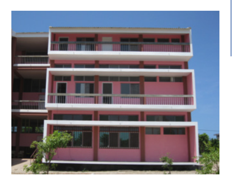
The Center for Infectious Disease Research and MHRP research site opened its permanent location on the campus of the Catholic University of Mozambique.

CIDI is the only clinical research center located in the central region of Mozambique. Beira is a major port city located in Sofala province that harbors one of the highest HIV prevalence rates, 15.5%, in the country (INSIDA, 2009). The HIV epidemic in Beira, Mozambique took hold while the country was economically impoverished following 16 years of civil war.