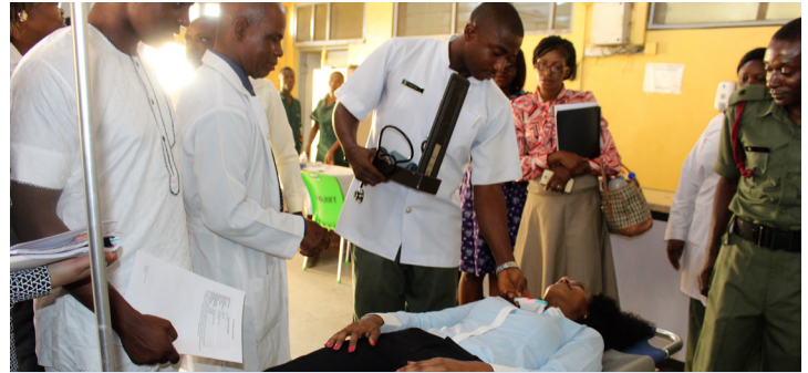
Clinicians interview a mock patient during training for RV466.

The Joint West Africa Research Group (JWARG) began a study in September designed to identify cases of suspected severe infectious disease at medical centers in West Africa. The study is being led by MHRP with the Nigerian Ministry of Defence.