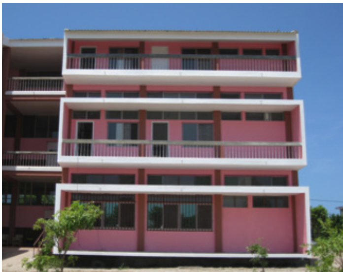
The Center for Infectious Disease Research and MHRP research site opened its permanent location on the campus of the Catholic University of Mozambique.

CIDI is the only clinical research center located in the central region of Mozambique. Beira is a major port city located in Sofala province that harbors one of the highest HIV prevalence rates, 15.5%, in the country (INSIDA, 2009). The HIV epidemic in Beira, Mozambique took hold while the country was economically impoverished following 16 years of civil war.