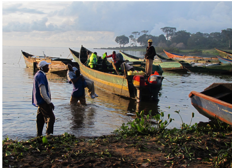
MUWRP staff travel by boat to remote islands in Lake Victoria with all necessary supplies to provide HIV prevention, care and treatment services.

MUWRP recently renovated the Koome Health Center on the island to better serve the community and to bring HIV care and treatment services closer to this fishing community. Plans are underway to bring SMC services to more fishing communities throughout these remote islands.