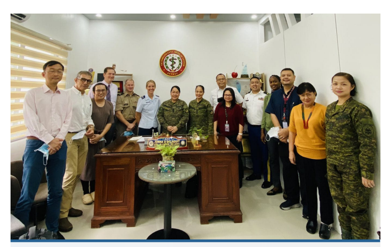
The MOCHI study team met with staff from the Philippines AFRIMS Virology Research Unit (PAVRU) in Manila. PAVRU, an arm of the Virology Department at AFRIMS, will provide laboratory support for the study.

Research partners in the Philippines include the service delivery organization Love Yourself, the Armed Forces of the Philippines and the Philippines AFRIMS Virology Research Unit (PAVRU). The study is funded by the Division of AIDS, NIAID, U.S. National Institutes of Health.